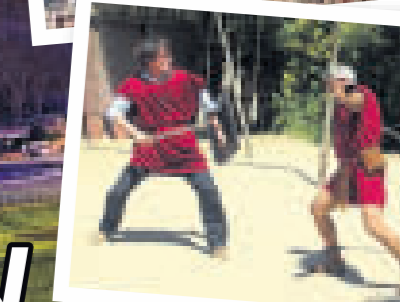
ETERNAL CITY... ruins of Coliseum, main picture, Vatican, top, and training to be a modern gladiator