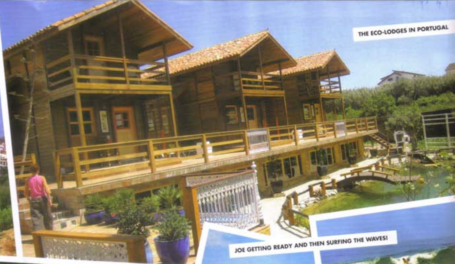
JOE GETTING READY AND THEN SURFING THE WAVES!