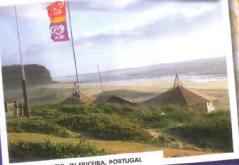
THE PRAIA D'AZUL, IN ERICEIRA, PORTUGAL