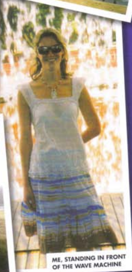
ME, STANDING IN FRONT OF THE WAVE MACHINE