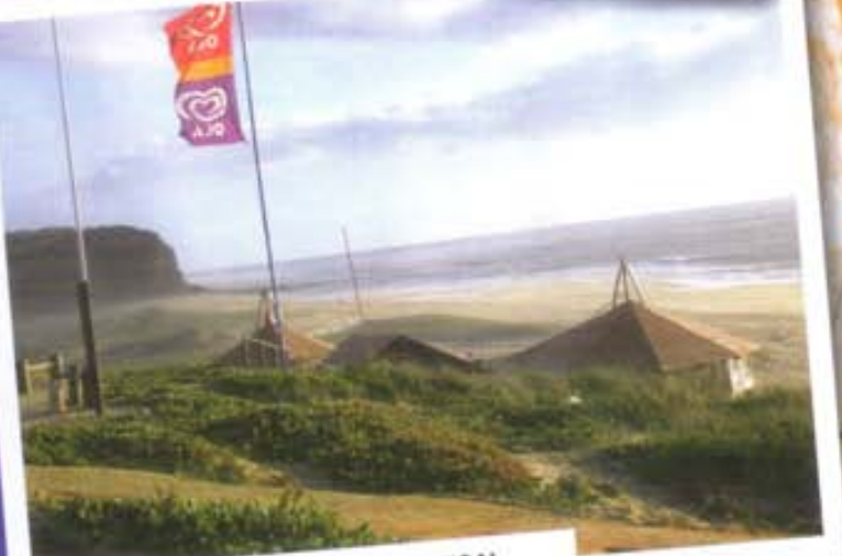
THE PRAIA D'AZUL, IN ERICEIRA, PORTUGAL